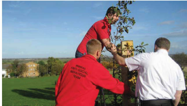
Grange Park, West Kirby

The Grange Park area of West Kirby saw environmental improvements led by the Friends of Grange Park residents' group with the planting of cherry trees and a lantern making workshop with children and young people. Tower Grounds in New Brighton saw local residents lead on an environmental audit with agencies. Work was undertaken in partnership with Leasowe Community Homes, taking the opportunity to speak with residents and young people attending the annual 'Unity in our Community' Halloween fancy dress party.